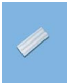
Extra Soft. | Highly Absorbant.

The Leifheit Picobello Sensitive Head can be seen with full details along with many other relevant products on our internet shop located here; www.cleaningproductshop.co.uk