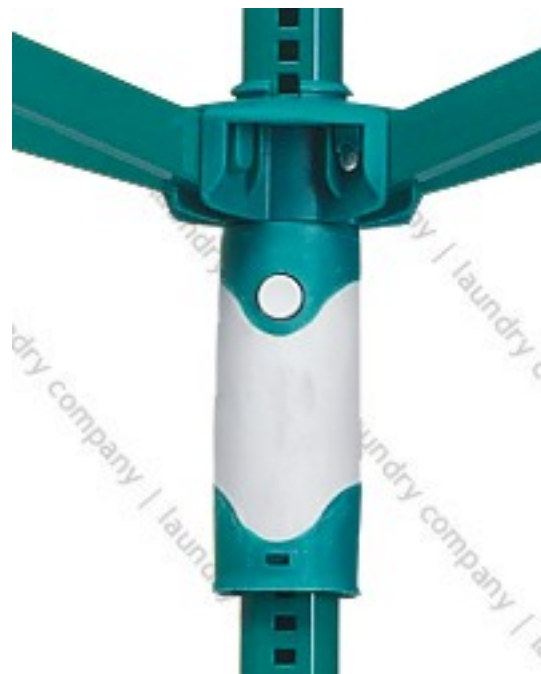
Heavy duty 38mm diameter main support pole. | 4 Arm 45m, 2.95m turning diameter strong easy clean